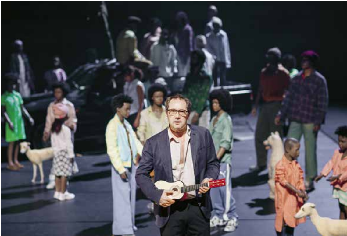
GIJS SCHOLTEN VAN ASCHAT | AMSTERDAM | 2011